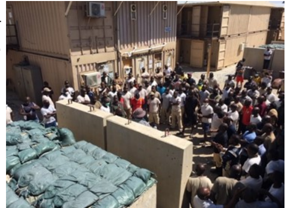
Contract employees receiving demobilization instructions

In the contingency environment, exigencies can sometimes arise that carry the potential for financial, physical, or emotional hardship for our contracted workforce. Having a network of caring and empowered professionals, from Command Authority, to Contracting Authority, to appropriate oversight – for example, through CENTCOM's Operational Contracting Support and CTIP functions – positions the U.S. Government to respond quickly and appropriately to resolve human trafficking issues as they arise.