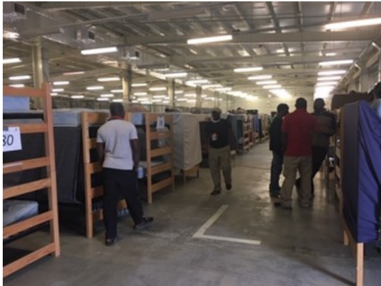
Transient Housing for Demobilizing CAAF Employees

The U.S. Government has thousands of foreign Contractors Authorized to Accompany the Force (CAAF) within its various areas of operation. Some portion of this population is in continuous flux due to contract expirations, resignations, terminations, and demobilization. As elements of the CAAF population are moved to transient status, normal processes occur: pay is cancelled, access to healthcare is withdrawn, base access badges are withdrawn with an "escort-only" badge assigned, access to communication systems and devices is removed, and the demobilized employee is moved to a transient living space. Under normal circumstances, these factors are completely transparent because the transient experience is measured in hours, not days. Under normal operating conditions, these processes occur outside the scope of traditional CTIP programs and awareness.